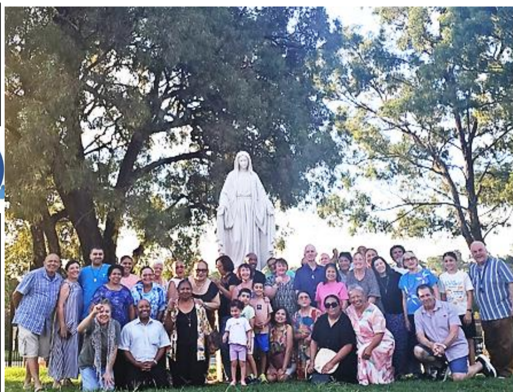
Celebrating Our Lady of Lourdes with an outdoor Rosary before Mass